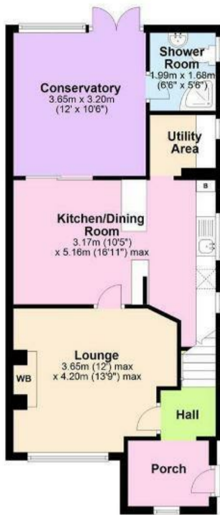
Ground Floor Approx. 57.3 sq. metres (617.0 sq. feet)