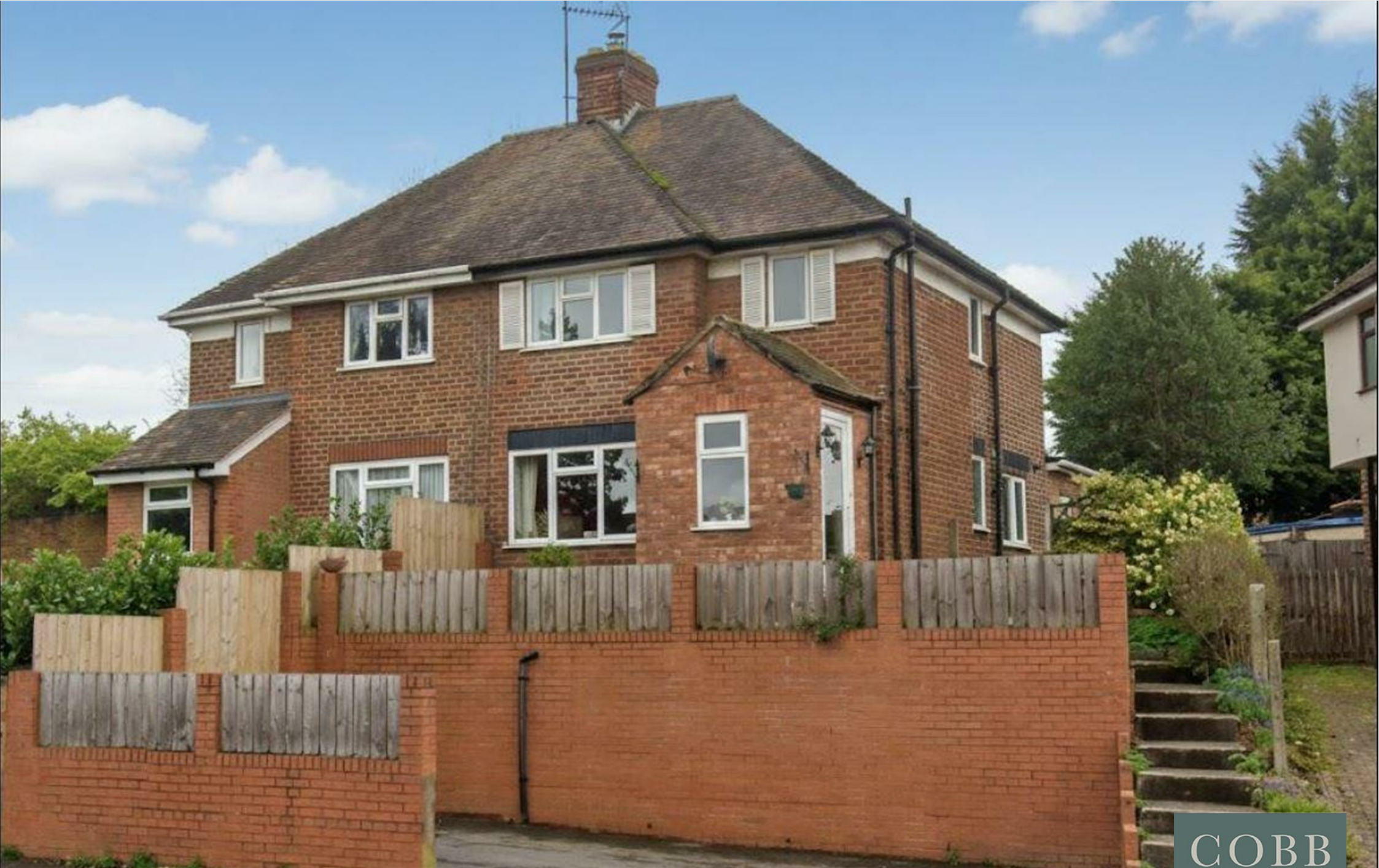
3, Old School Lane, Hereford, HR1 1EU Price £250,000